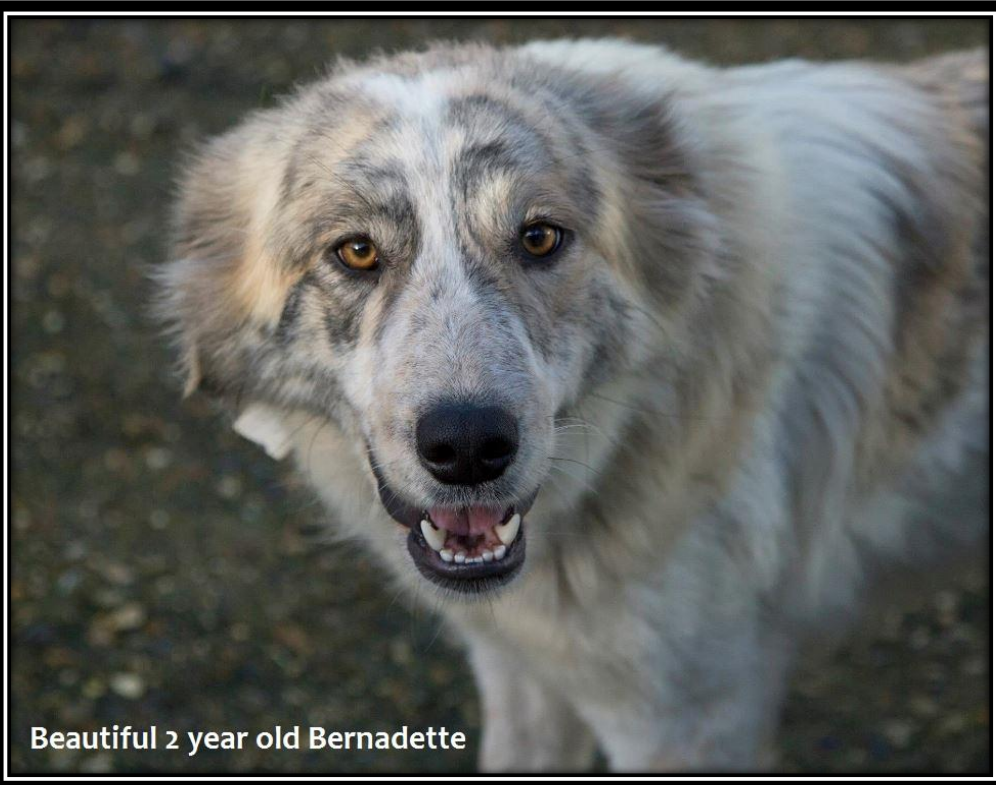
Beautiful 2 year old Bernadette