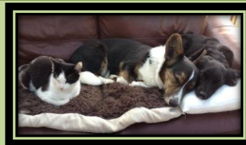
Underdogs Poppy (left) and Murphy (right)