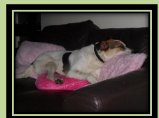
Vlad – what can we say?