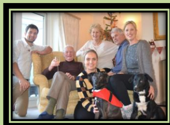
All Allen's Christmas' came at once