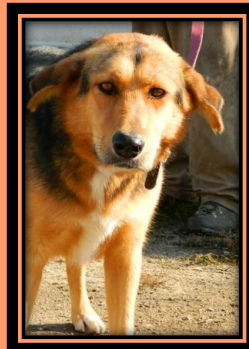
Saffron, 4 year old girl