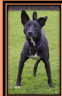
Apple is a 1 year old girl