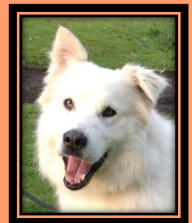
White is a 10 year old boy

For more information of these and all of our dogs please contact: deb@loveunderdogs.org