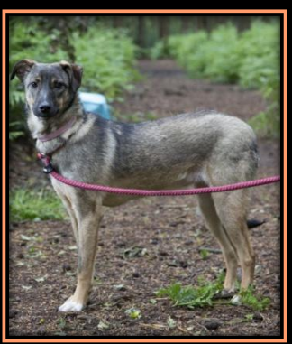
Medina is 1 year old

Just a few of our dogs seeking their forever homes