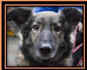
Max Boy is 5 years old